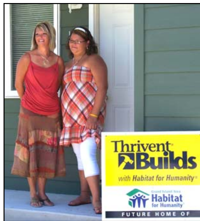
Thrivent Financial for Lutherans provided a majority of the funding for home 46, shown left.

Thank you for your past financial and in-kind support, volunteerism and prayers for projects like this one. TOGETHER we build homes, lives and a better community.